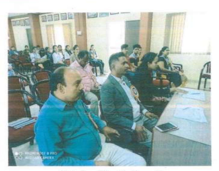
Evaluation of Elocution Competition